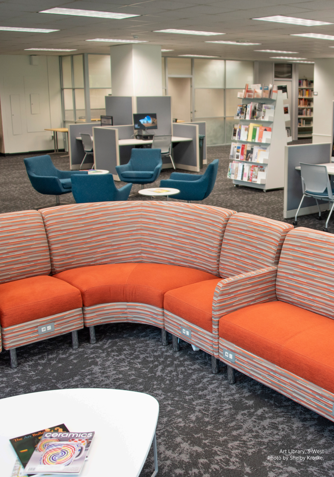
Art Library, 3-West