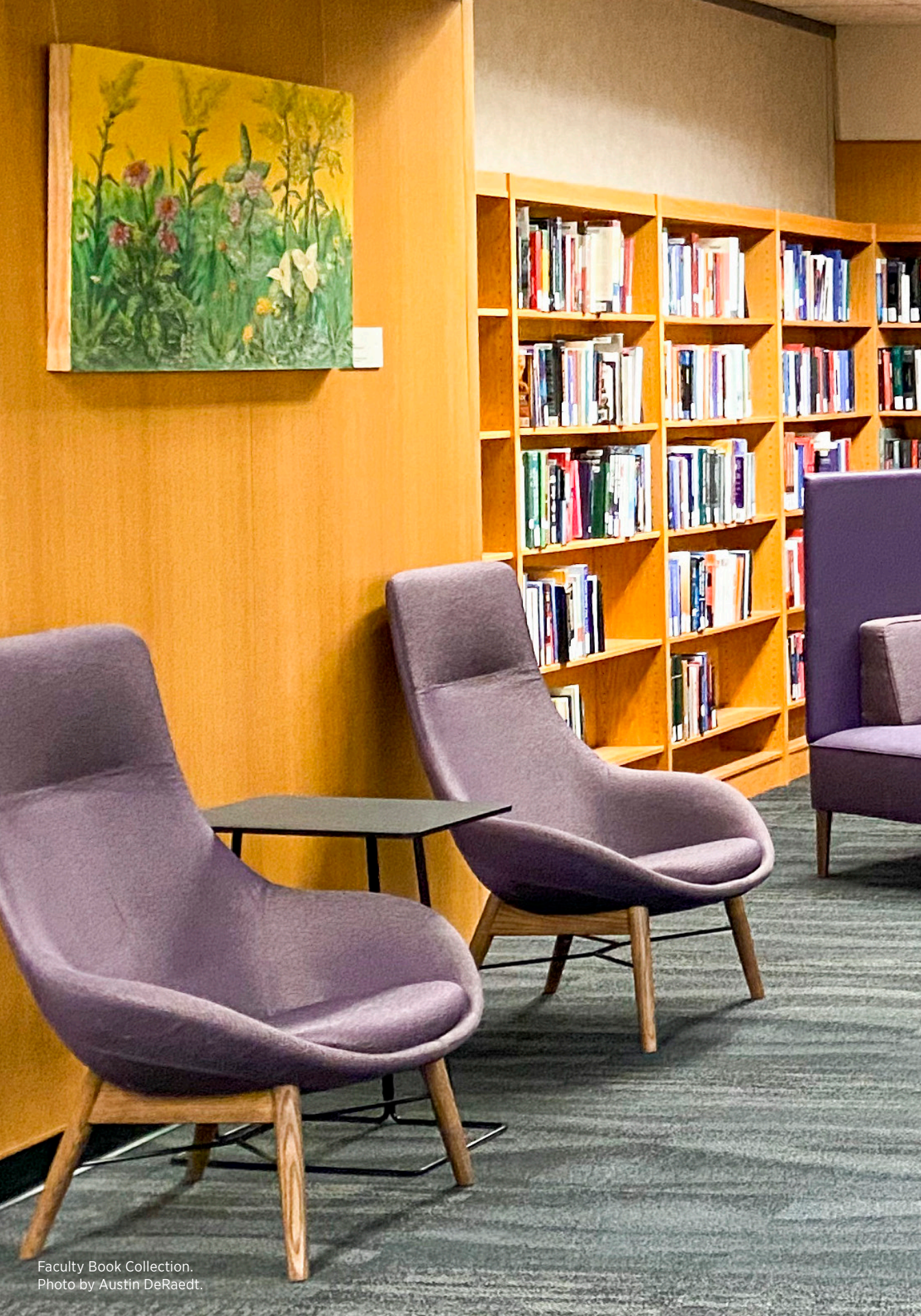
Faculty Book Collection.

The Stanley C. and Selma D. Hollander Faculty Book Collection was established by the MSU Libraries in 1998 to recognize and honor the scholarly work of MSU faculty members who have written, edited, or translated a book or musical score; contributed to a multimedia work; or participated in a professionally recorded musical performance.